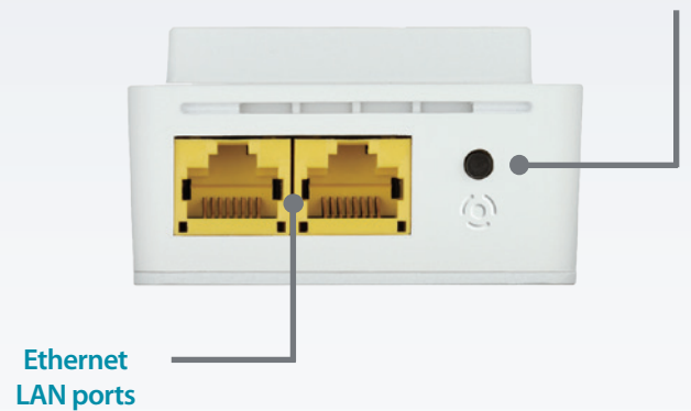
Simple Connect button