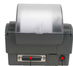
25-pin RS-232 connector 10V DC 3A power jack