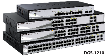
DGS-1210 SWITCHES SMART GIGABIT PoE

The network underlying the surveillance system had to be suitable for the transmission of large amounts of data and adapted to an industrial environment (possible electromagnetic interference), as well as suitable for long-distance connections.