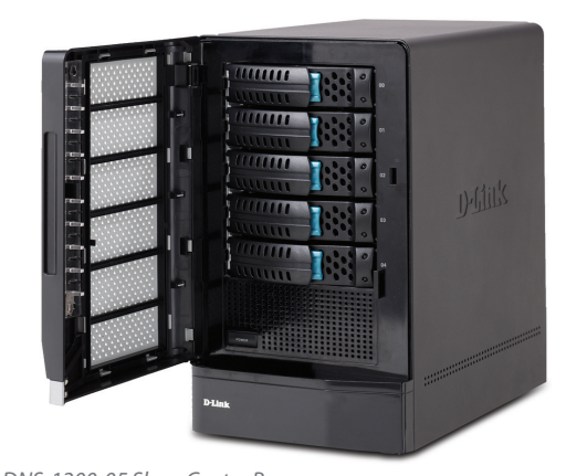
DNS-1200-05 ShareCenter Pro Unified Network Storage

High-Performance SAN – SAN (Storage Area Network) arrays offer tremendous power for large networks. A SAN is a dedicated storage network that puts the data stored on a variety of devices—including disk arrays and optical libraries—within the reach of various servers. However, high performance is typically only available at premium costs. Entry level solutions are easily upwards of $20K. Over the course of the last decade, SAN technology has become