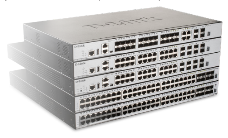
Figure 1. D-Link DGS-3630 Series Layer 3 Stackable Managed Switches

The DGS-3630 Series Layer 3 Stackable Managed Switches are designed for Small to Medium-sized Businesses (SMBs), Small to Medium-sized Enterprises (SMEs), large enterprises and Internet Service Providers (ISPs). They deliver high performance, flexibility, fault tolerance and advanced software features, for maximum return on investment. With Gigabit Ethernet, SFP, 10 GbE SFP+, security features and advanced Quality of Service (QoS), the DGS-3630 Series can act as core, distribution or access layer switches. High port densities, switch stacking and easy management, make the DGS-3630 Series suitable for a variety of applications.