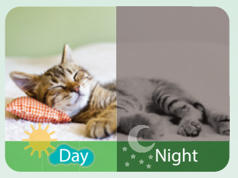
Day & Night Vision