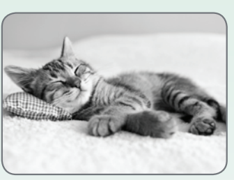
See up to 5m in the dark