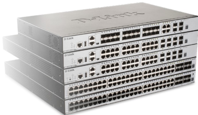
Figure 1. D-Link DGS-3630 Series Layer 3 Stackable Managed Switches

The DGS-3630 Series Layer 3 Stackable Managed Switches are designed for Small to Medium-sized Businesses (SMBs), Small to Medium-sized Enterprises (SMEs), large enterprises and Internet Service Providers (ISPs). They deliver high performance, flexibility, fault tolerance and advanced software features, for maximum return on investment. With Gigabit Ethernet, SFP, 10 GbE SFP+, security features and advanced Quality of Service (QoS), the DGS-3630 Series can act as core, distribution or access layer switches. High port densities, switch stacking and easy management, make the DGS-3630 Series suitable for a variety of applications.