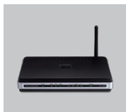
DSL-2640B ALL-IN-ONE WIRELESS G ADSL2+ ROUTER

If any of the items are missing, please contact your reseller.