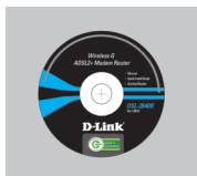
CD-ROM (D-Link Click'n Connect. Manual and Warranty)